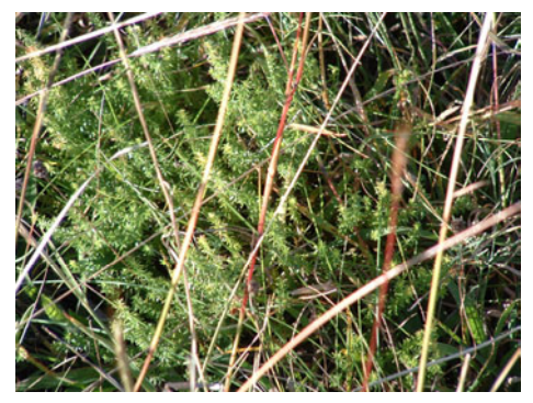
Above—small forbs like woodruff are coming back into the species mix.

recorded the highest infiltration rates of any sites.