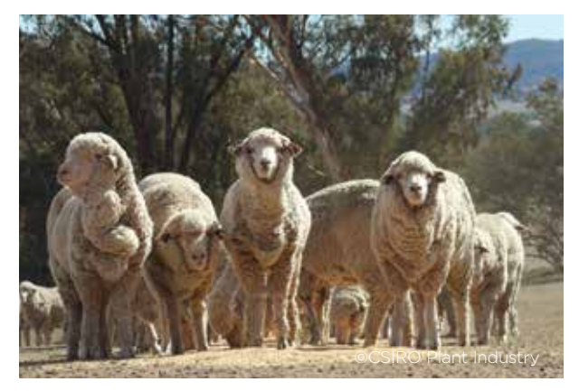
If your genetics are suboptimal, this might be a good opportunity to upgrade your flock.

Production feeding looks at the decision of whether to bring forward the normal sale of sheep or whether to feed them in order to gain additional weight. Feeding for weight gain requires a different rule of thumb to the one used for maintenance. The rule of thumb to use is 7kg of dry matter (of grain quality) is required for every 1kg of liveweight gain' on average across the whole mob.