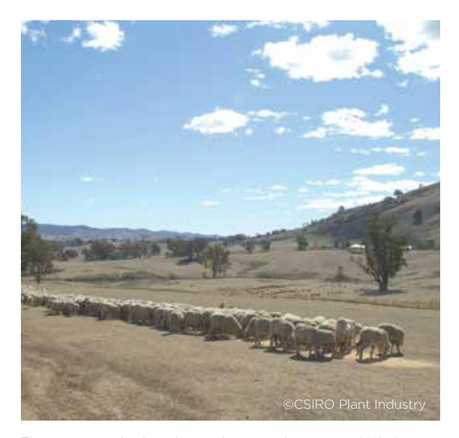
The presence of a drought may increase the rate at which the national flock declines.

In past droughts, after allowing for some short term spikes in prices immediately post drought, the price trends have returned to their pre-drought patterns. Graph 1 shows historical mutton prices from January 1978 to June 2006. The dark blue sections highlight times of widespread drought across the industry.