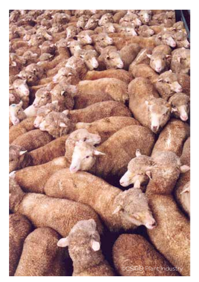
Predicting the future value of sheep is a particularly difficult part of the whole exercise.

There are three parts to this process. The first is some preparatory work that needs to be done so that you are organised enough to make the decision. The second is calculating the variables mentioned previously for each separate class of sheep in the flock. The last step is to put all of the information together to make the best possible decisions.