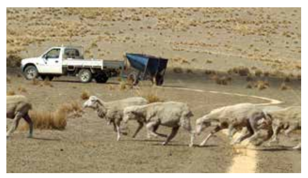
Do not assume that what was the correct decision last time will still the case this time.

If the feeding period is five months, and there were no discounts applicable to the wool, then the value of fleece grown is 26.60 \div 12 \times 5 = 11.10 . However, this must be adjusted further for possible discounts due to staple length, strength and dust.