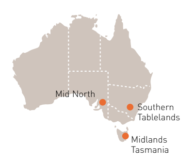
Research sites for the LWW Rivers and Water Quality sub-program are established in Midlands Tasmania, Southern Tablelands Yass NSW and Mid North, SA.