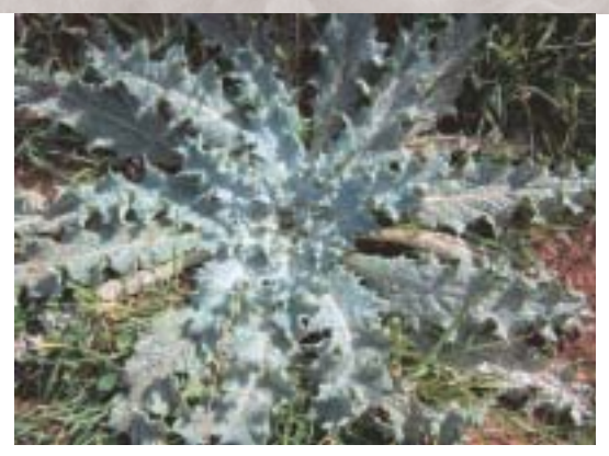
Left: The Wild artichoke thistle ( Cynara cardunculus ) is very invasive and can quickly spread along creeks. Above: The Wild artichoke thistle forms a rosette of very large, deeply lobed leaves that can be up to 30 cm wide.