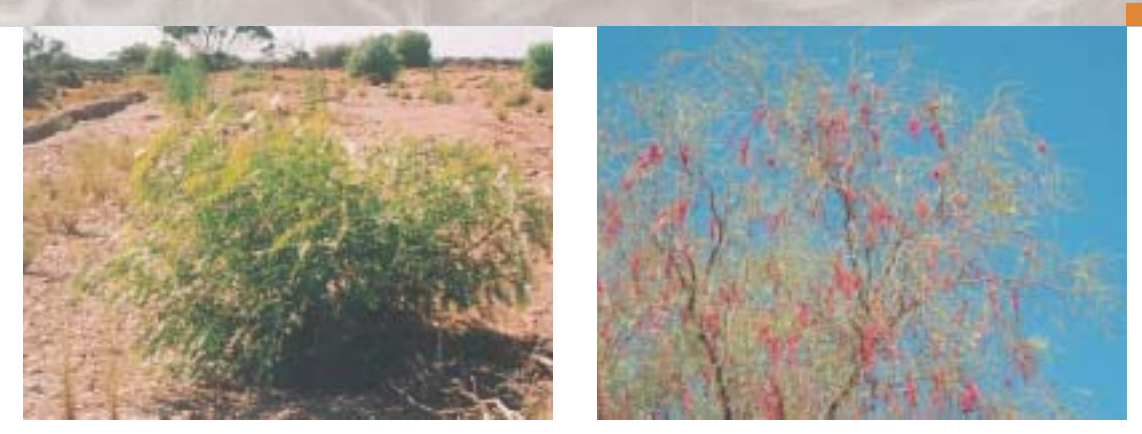
Left: The Pepper tree ( Schinus molle ) has drooping fern-like leaves and can grow into a large spreading tree up to 12 metres in height. Right: Pepper tree fruit is small, pink and red and generally matures over summer.