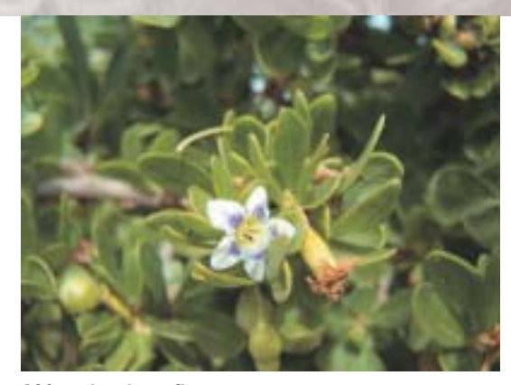
African boxthorn flower.