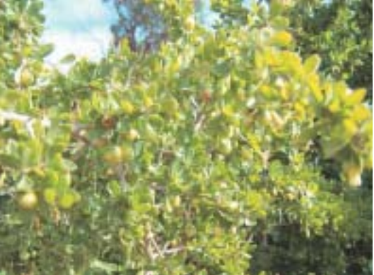
Left: African boxthorn ( Lycium ferocissimum) is extremely tough and has an extensive, deep root system. Right: African boxthorn fruit and leaves.