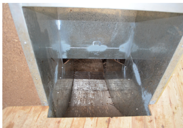
Figure 17: Wide, waist height, recessed chute and step down/vertical drop at the top of the entrance.

A step down/vertical drop into the chute of approximately 100 to 300mm before an easing slope/decent will assist when releasing sheep into the chute. The chute should continue on an angle which encourages the forward movement of the sheep but not at a rate that may injure the