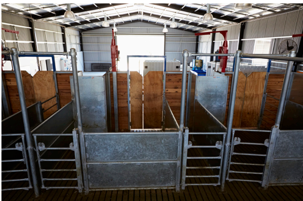
Figure 9: Example race-fill catching pen design, steel blind panels, variable doors (70:30) and boarded off chute.