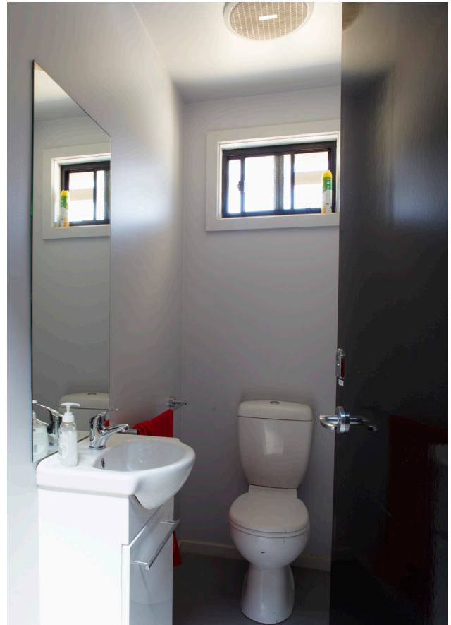
Figure 26: Male and female flushing toilets should be provided.