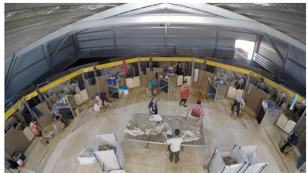
Figure 12: Raised 'L' shaped board and a flat 'U' shaped board.