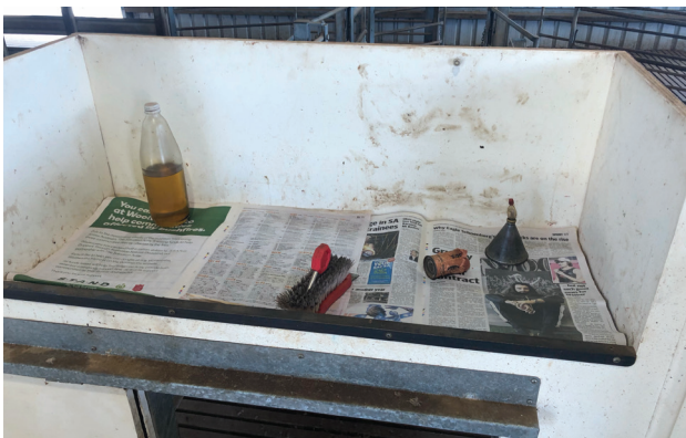
Figure 13: Raised leading edge/lip for storage to stop objects falling off.

At each stand there should be a shelf or recessed box for the shearer to place their oil can, cutter and combs etc. To minimise the impact of vibrations in the shed on shearers gear, rubber belt or timber-based storage help to look after their gear. If storage is on top of the chute, a raised leading edge/lip on this that will stop anything slipping off and falling into the chute can be useful.