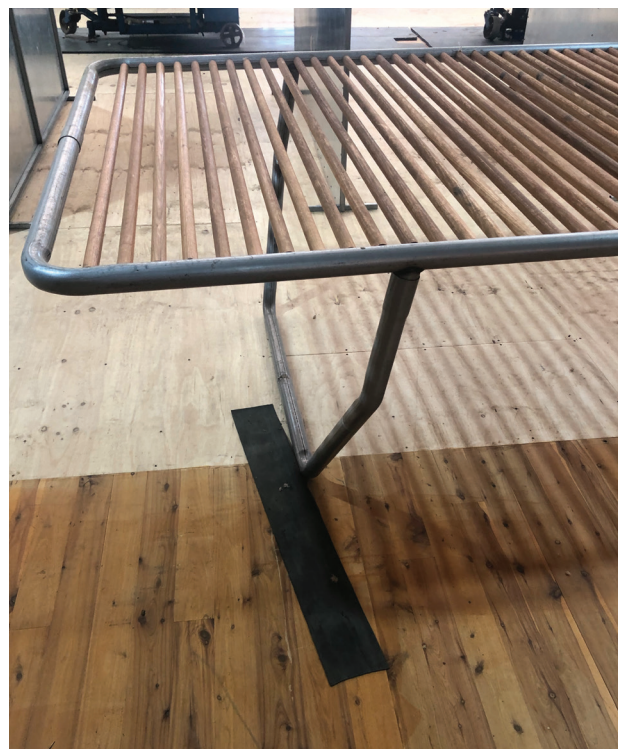
Figure 19: Rectangle wool table with a rubber mat which, goes under the leg stand to stop it shifting while in use.

The disadvantage of rectangular wool tables is that they require two people for efficient operation, one on each side for skirting and wool rolling.