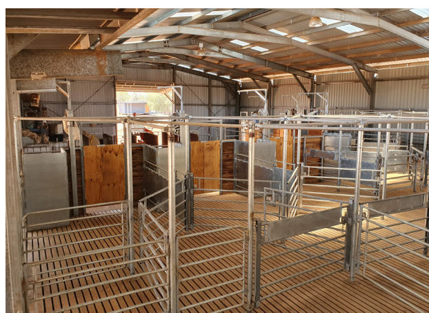
Figure 22: Timber blinded panel fencing and steel rail and blinded panel fencing.