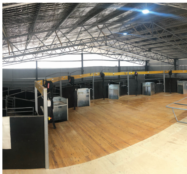
Figure 23: Artificial white lights centred over the wool room and table providing consistency for classing.

Where natural light is used to supplement artificial light, this is best done using translucent rather than transparent sheeting in place of iron in the walls or roof which diffuses the light sufficiently to avoid hard light and sharp edges (Figure 23).