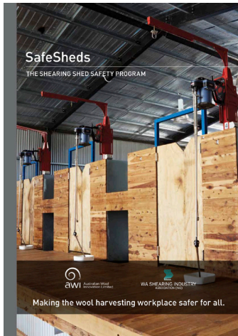
Figure 2: SafeSheds, The Shearing Shed Safety Program.