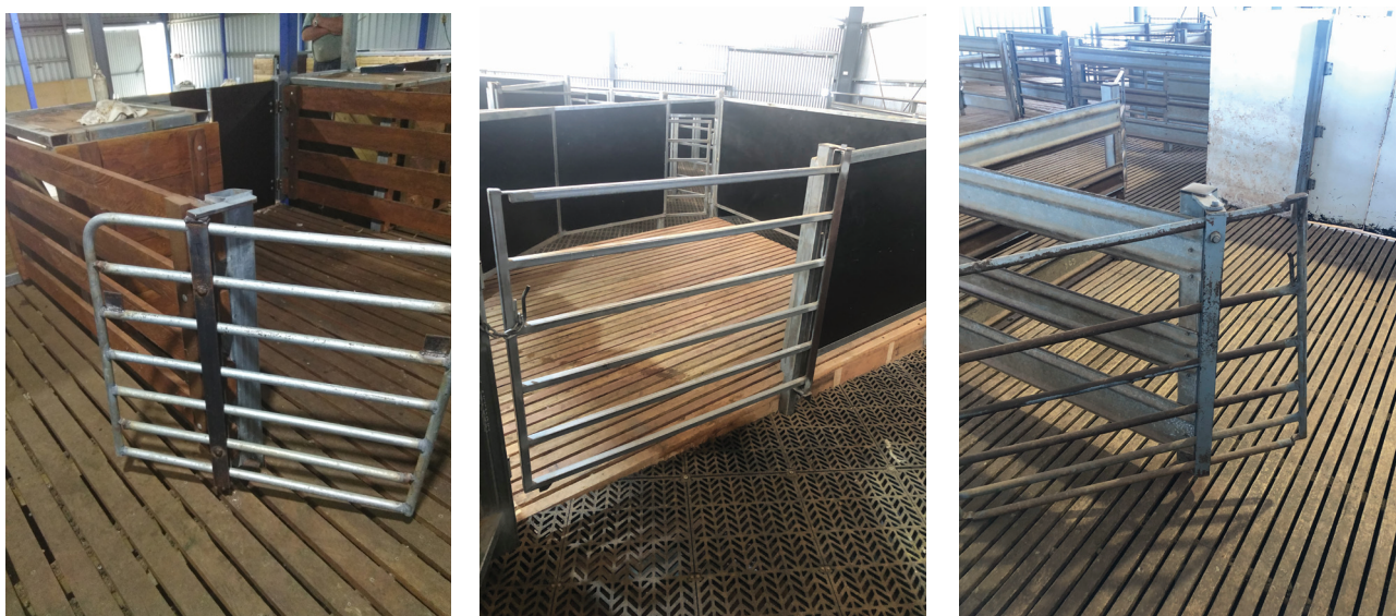
Figure 11: Example of slide-swing gates, when slid they can be sat in place with either end of the gate mounted in the stirrup towards the hinge.

As the name suggests, a guillotine gate lifts vertically, usually with a counter-weight to regulate the movement.