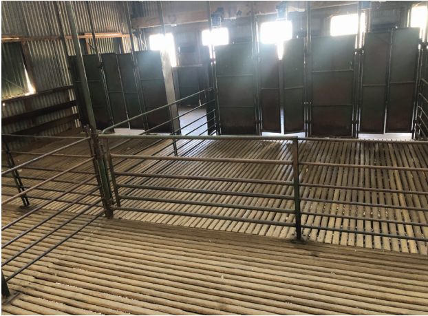
Figure 7: Back fill catching pen, note the change in timber slat direction in the catching pen to help with drag.