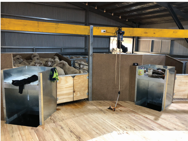
Figure 1: 'Arrow Park' shearing shed Dubbo NSW, the first shed built of the new AWI designs.

Many sheds have now been built off this new shearing shed design across the country, with