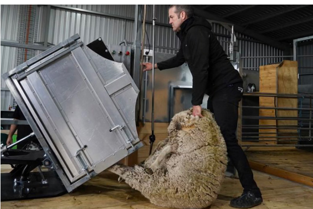
Figure 3: Modular race with and automated sheep delivery to eliminate the catch and drag.

For more information on this project go to www.wool.com/racedeliveryunit .