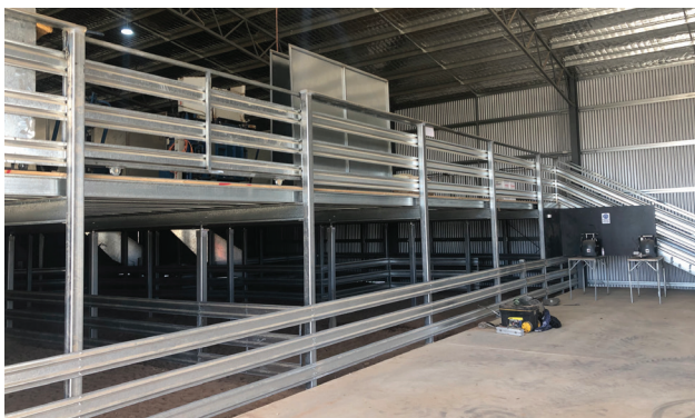
Figure 21: Wool room above in-shed storage, separate grinding area downstairs and the shed exterior complete to the ground.

If the shed is above ground, consider continuing the external walls to the ground level to reduce the amount of light and wind draughts entering the shed from beneath the floor. This can be achieved by using batons which also allow for improved ventilation.