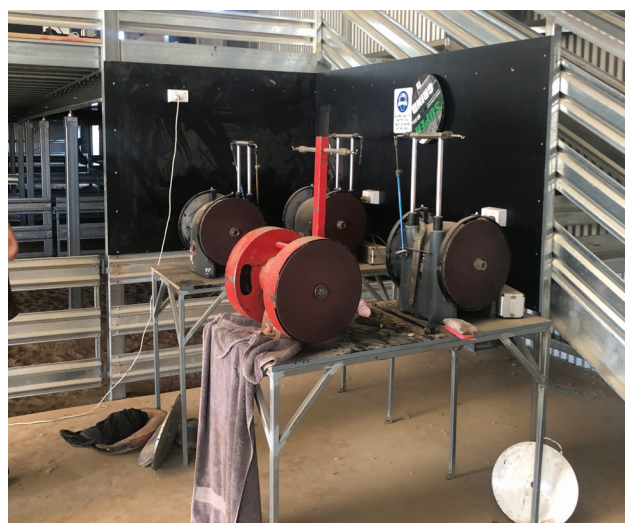
Figure 28: Separate grinding area away from the board and wool room.

Grinding should be done in a safe space away from other workstations.