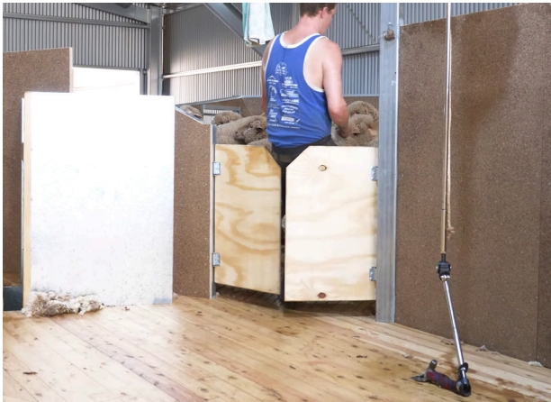
Figure 6: Low catching pen doors, below the shearers elbows on a front fill and sloped catching pen.

Front and side-fill catching pens with floors that slope upwards away from the door at a gradient of approximately 0.65-0.97 in 10 improve worker efficiency. For example in a 2900mm (2.9m) deep pen this is 188mm to 280mm higher at the back of the pen than the front.