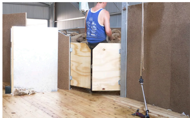
Figure 16: Low catching pen doors, below the shearers elbows, with a front fill, sloped catching pen.

Lower catching pen doors reduce the risk of shearer's hitting their elbows on the doors. Doors may be less than 1500mm (1.5m) high in front-fill pen configurations where the sheep run away from the doors when filling the catching pen. The gap between the floor and the bottom of the doors should be large enough to prevent sheep toes and the shearer's feet and heels from being caught but small enough not to encourage sheep to escape.