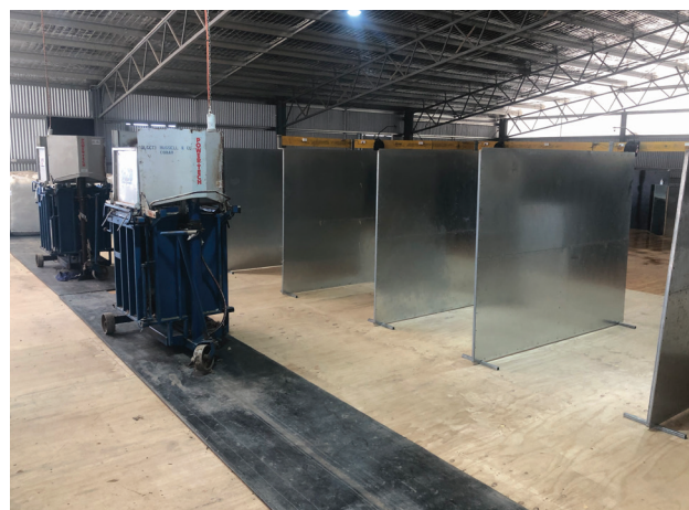
Figure 20: Portable, independent wool bin wall frames can be added and spaced out to the desired size and amount.

Mobile wool bins can be used for pieces, bellies or locks. They should be strategically located so that wool can be easily moved to the wool press. Where the main fleece line is going straight into the press after classing, mobile bins may be useful for holding fleeces when the press is being used for other lines.