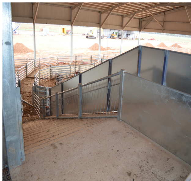
Figure 4: Shearing shed ramp with concrete flooring, walkway and screened sides.

Sheds built off the ground have a ramp leading to the shed entrance. This ramp should be at least as wide as the entrance door 2500mm to 3000mm (2.5 to 3m) to allow for rapid filling of the shed area. The entrance ramp should have a maximum gradient of three to one. The ramp floor can be made from wood or concrete with sufficient grip so that sheep don't slip. Steel flooring is not recommended as it is noisy, more uncomfortable under foot for sheep and sheep's toes can get caught. The sides should be screened so that sheep cannot see out and become distracted.