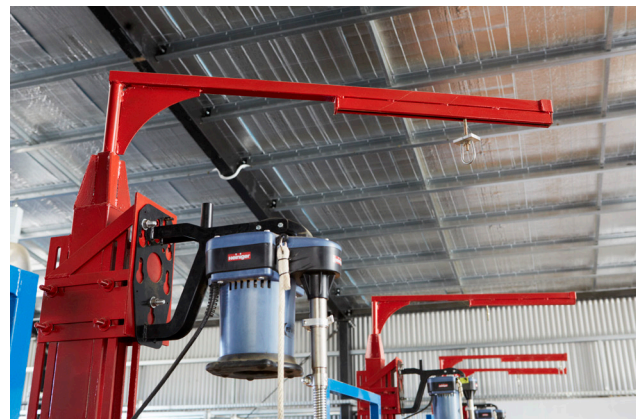
Figure 14: Harness mount pivoted to swing in any direction with the ability to slide in and out along the mounted arm.

Harness mounts can be placed above or next to overhead shearing plants. It is important that these can structurally hold the weight of the shearer in the harness, can pivot and swing as well as slide in and out along the overhead mounted arm as show in Figure 14 below.