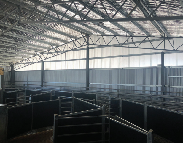
Figure 24: Natural light from translucent wall sheeting.