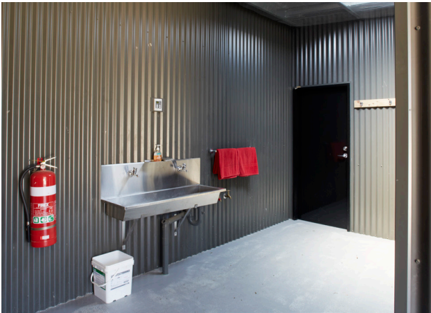
Figure 25: Separate washing area and fire extinguisher.