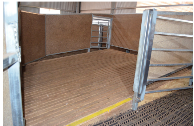
Figure 8: Plastic grating fill pen floor, slide/swing gate and front fill catching pen; sloped, timber slats parallel to drag, high visibility trip hazard paint.