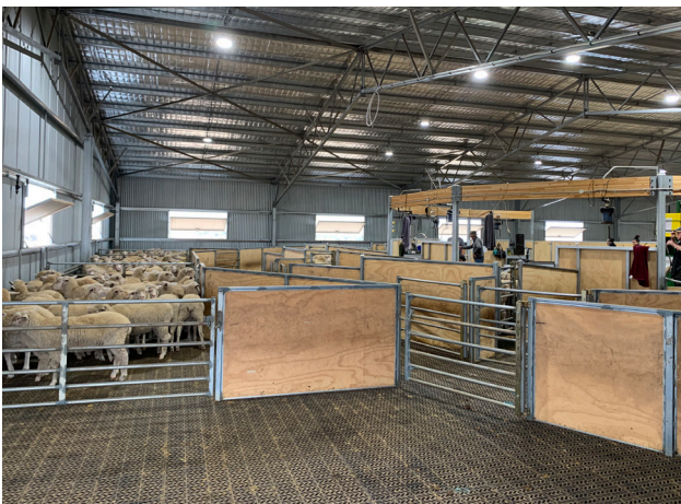
Figure 10: Plastic grating for holding and fill pens, it is deep and non-directional which is effective for sheep movement in any direction.

Seasoned hardwood or pine slats measuring about 40mm x 30mm laid with 15mm gaps result in an effective, self-cleaning floor. These slats should be laid across (perpendicular to) the intended 'flow' or direction of movement of the sheep so the sheep see less light underneath the floor. This will make it easier to move the sheep through the shed. The exception to this is in the catching pen where it is recommended to always use timber slats and the grating runs parallel to the path of drag to