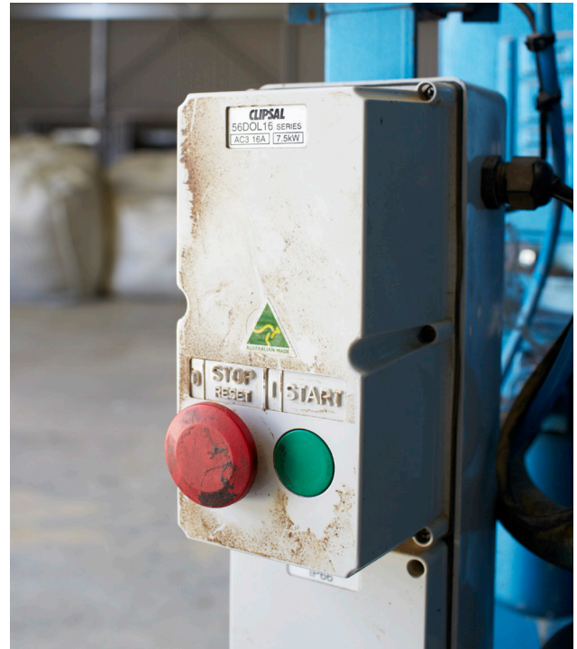
Figure 29: Wool press safety kill switch.

Wool presses are potentially dangerous if mis-used and strict attendance to safety guidance is required. Best to consider inducting those planning to operate the press prior to shearing commencing. Kill switches are a useful safety risk mitigation strategy.