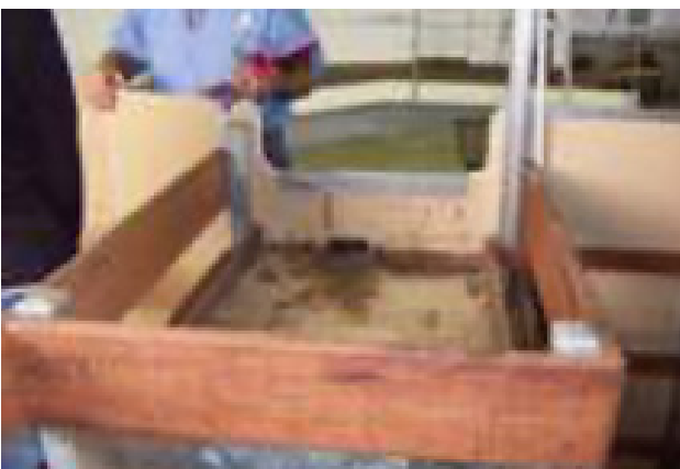
Figure 5: Boarded off chute and additional storage.

In calculating the in-shed pen area needed for sheep storage, allow 2.7 full wool grown sheep per square metre.