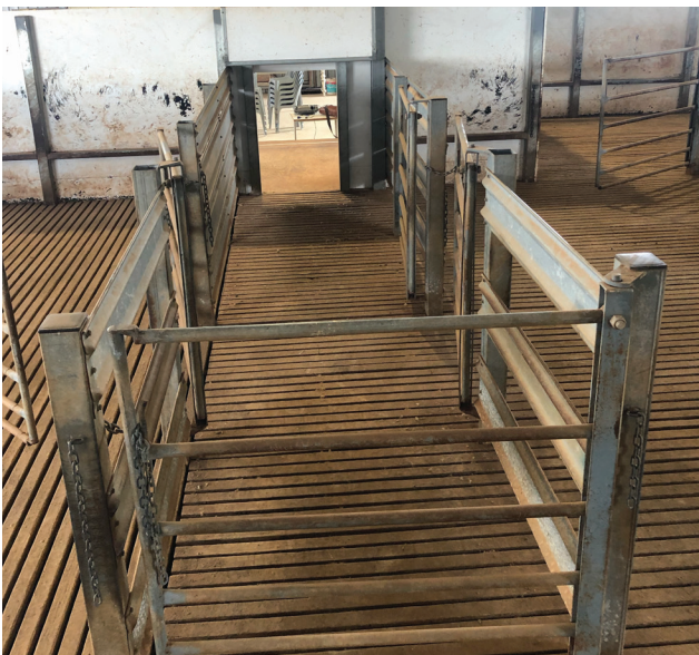
Figure 18: Return race for shorn sheep back onto the grating inside the shed.