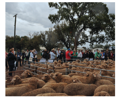
Macquarie's 2018 Drop F1 ewes on display and field day crowd, March 2020.