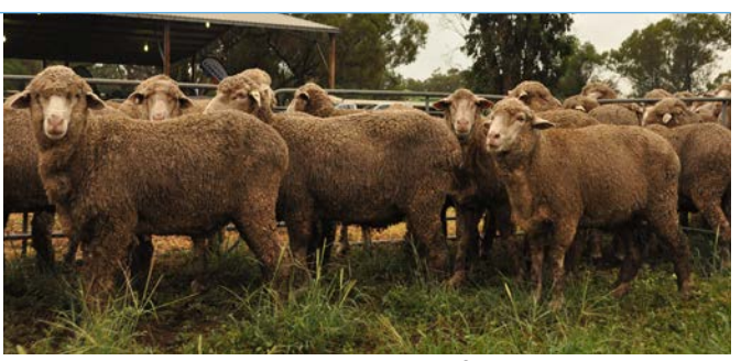
Macquarie 2018 drop ewes in the rain at the field day, March 2020

With 180mm of rain received already in 2020 the Macquarie ewes will move to some green feed during lambing after years of drought feeding. Pregnancy scanning took place in February with both drops averaging a condition score of 3.1. The 2018 drop maiden ewes scanned 111% foetuses with 95% of ewes in lamb and the 2017 drop scanned 134% foetuses and 94% of ewes in lamb. This is a great conception result for the site, especially considering the recent dry conditions. As reported, a successful field day was held on March 4.