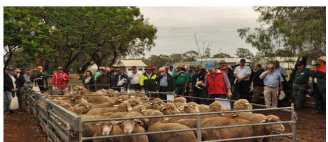
Penside sire introductions at Macquarie's MLP field day, March 2020