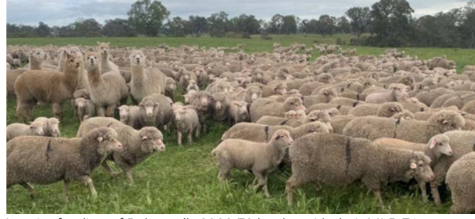
Imprint feeding of Balmoral's 2020 F2 lambs with their MLP F1 mothers, November 2020. Dark rib line is vegetable oil residue from EMD/FAT scanning.

Classing and fleece measurements will be completed by February with the final site joining scheduled for March.