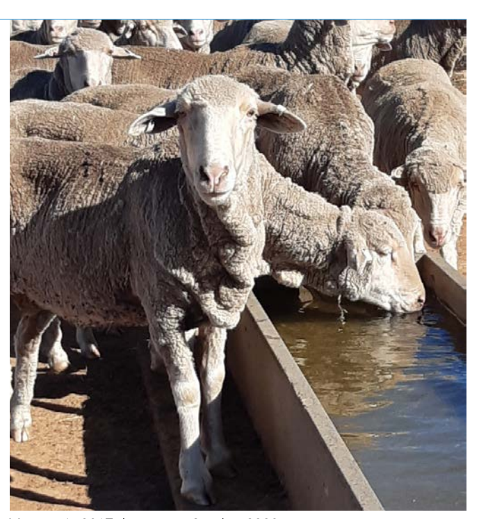
Macquarie 2017 drop ewes, October 2020.

Weaning took place in December. The 2017 drop ewes achieved a 122% weaning rate and the maiden 2018 drop 97%. At weaning the 2017 drop ewes averaged 56.8kg and the 2018 drop ewes averaged 52.1kg, with both drops averaging 3.0 CS.