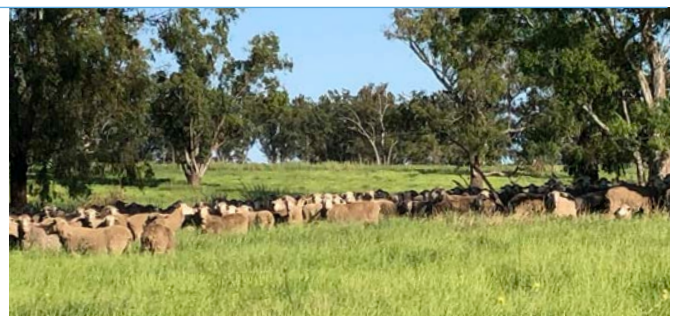
MLP F1 ewes, December 2021.

Save-the-date - 2022 field day - March 30.