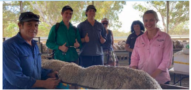
The Balmoral team completing the final individual WEC sampling, December 2021.

The final field day is scheduled for February 17, 2022 following the final classing and midside sampling early in the month and the classer trial the day prior. RSVPs essential: balmoralfielddays2022.eventbrite.com