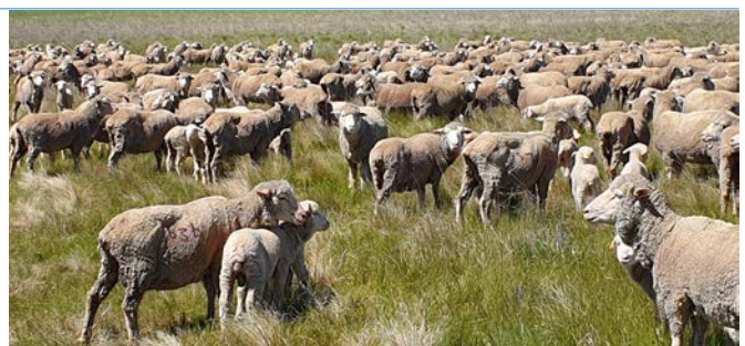
MLP F1 ewes and F2 lambs, November 2021.

Preliminary lambing results over a wet and cold season saw a 114% of lambs tagged to ewes joined. Site hosts, CSIRO, undertook lambing rounds recording pedigree, birth type and date, ewe behaviour and lamb mortality data. Weaning took place early in December with only 6 lambs lost from tagging resulting in 113% lambs weaned to ewes joined. Ewes were back in condition owing to the wet conditions with the 2017 drop averaging 48.2kg and CS 2.4, with the 2018 drop averaging 49.8kg and CS 2.8.