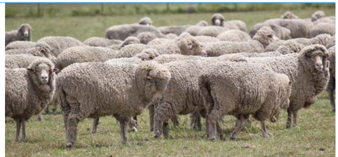
MerinoLink's MLP F1 ewes pre-shearing, October 2021.

At weaning in September which followed a wet, cold winter with a high worm burden, 103% lambs were weaned to ewes joined. The 2016 drop ewes averaged 60.8kg and CS 2.3, while the 2017 drop averaged 62.1kg and CS 2.5. The change of season saw a massive pasture growth with a corresponding production improvement. Classing and midsides were undertaken in mid-October. December pre-joining assessments saw the 2016 drop ewes sitting at 67.4kg and CS 3.3, the 2017 drop ewes averaging 68kg and CS 3.4.