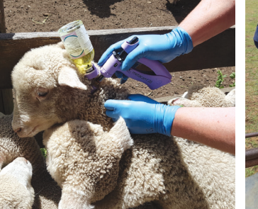
Metacam 20<sup>®</sup>, a subcutaneous injection high on the neck behind the ear.

Tri-Solfen<sup>®</sup>, a local anaesthetic, was registered 13 years ago, whilst the Non-Steroidal Anti-Inflammatory Drugs (NSAIDs) Metacam<sup>®</sup> and Buccalgesic<sup>®</sup> were registered in 2016 and 2017 respectively.