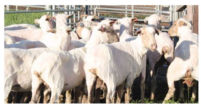
Shearing sheep reduces wool length so flystrike prone areas dry quickly.