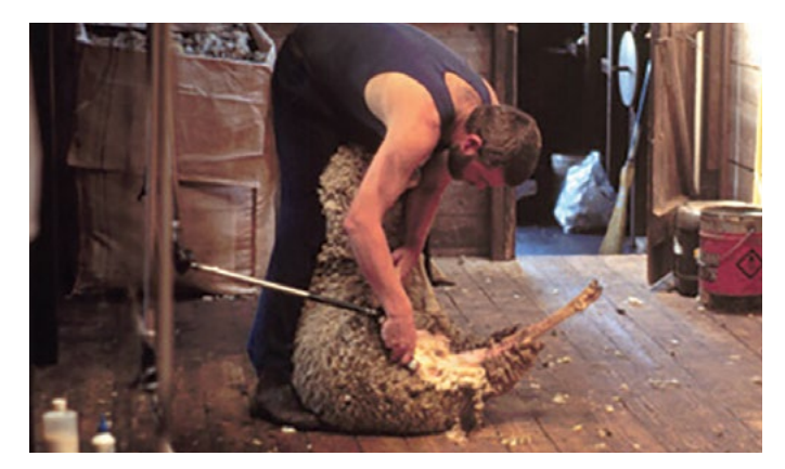
Crutching sheep reduces dags and urine stain which attract flies.