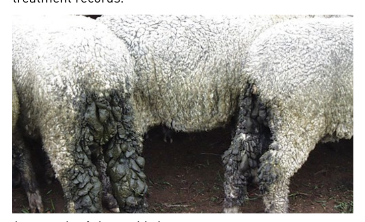
An example of sheep with dags. Source: Dealing with Dag Advisor Manual (2019), AWI

When considering a dressing, check for withholding periods and slaughter intervals. Keep accurate treatment records.