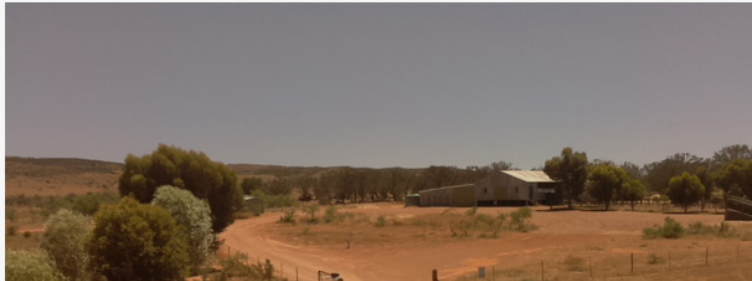
Figure 3: The purpose built website that controls the gate system. The signal goes from the website to the camera and then to the gate mechanism.