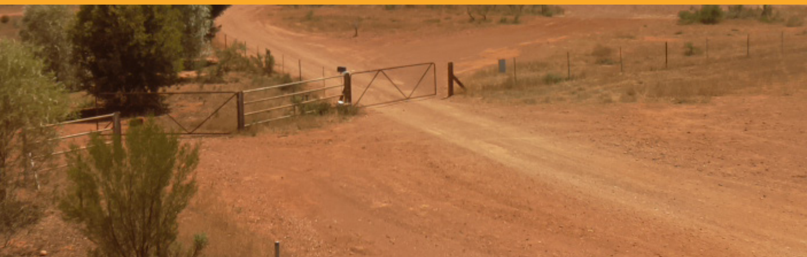
Figure 2: The gate system opening remotely (right). The camera takes photos as proof that the system is working.