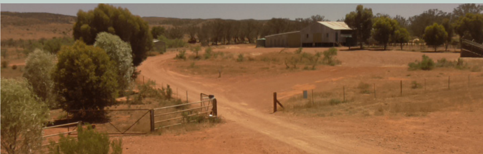
Figure 4: The gate system opened (right). The camera takes photos as proof that the system is working.

To view more innovation profiles, business cases and videos of innovations in the pastoral zone, visit the Bestprac website www.bestprac.info