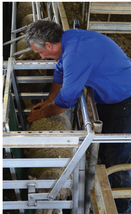
Visual classing at the Elders Balmoral site.

The very first Merino Sire Evaluation programs were established in 1987 by the NSW Stud Merino Breeders Association in partnership with the University of Sydney and NSW Agriculture. They were initially concentrated in NSW: Hay, Deniliquin, Dubbo and Walcha.