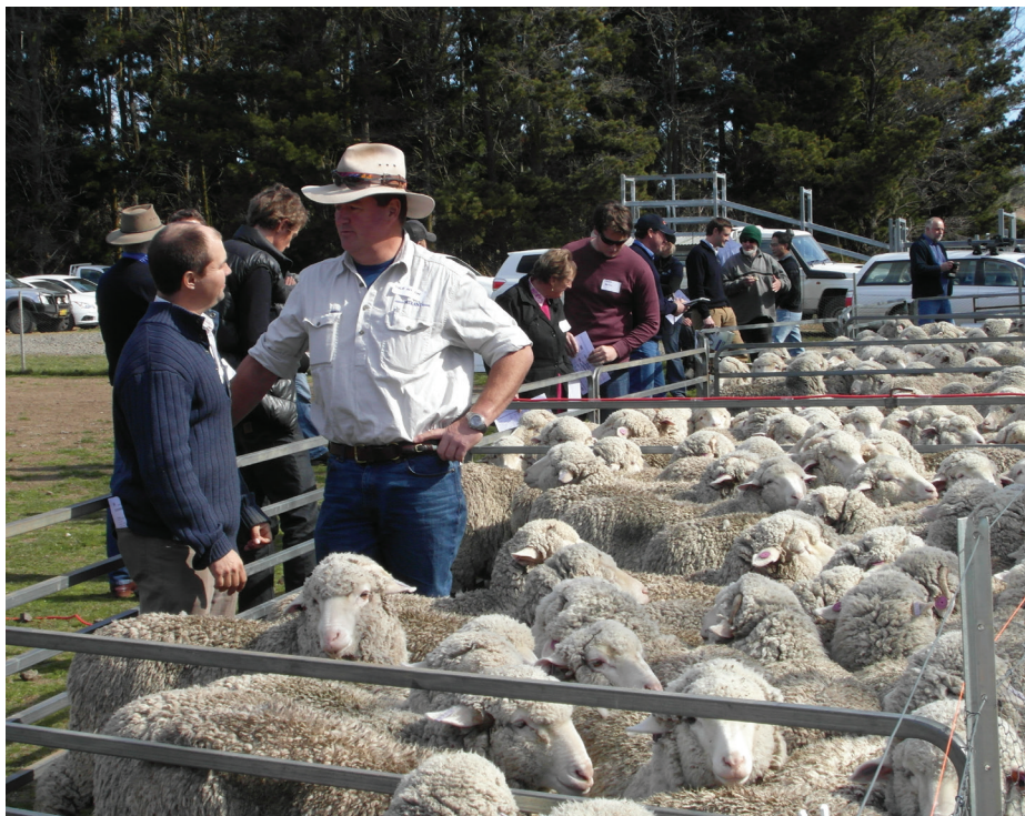
New England Sire Evaluation Field Day.

The Merino Sire Evaluation program operates at nine separate sites across Australia and compares the breeding performance of sires from different flocks . Their progeny are assessed for a large number of measured and visual performance traits, which helps woolgrowers select sires across a large range of breeding objectives .