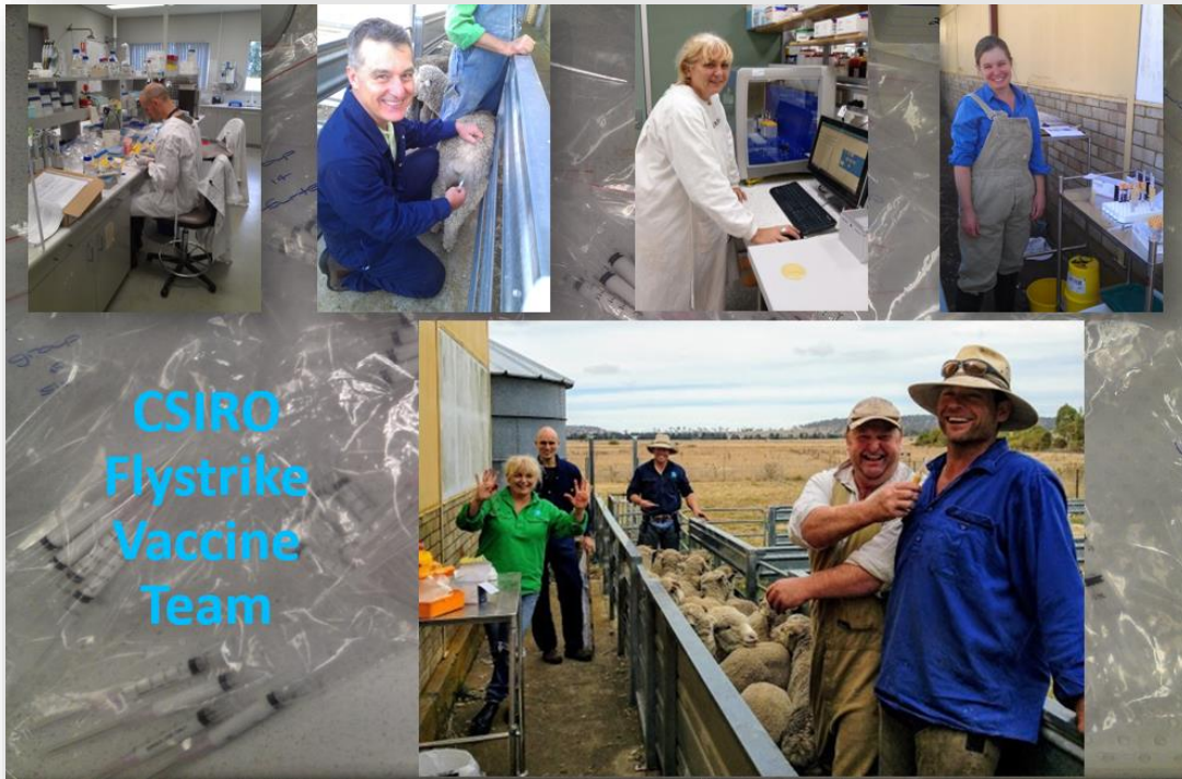
Figure 5. CSIRO research team undertaking tasks associated with flystrike vaccine development.