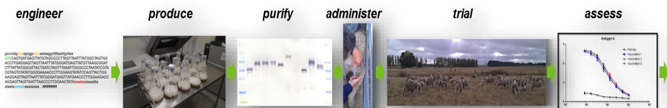
Figure 3. Key steps in the process of engineering and formulation of candidate antigens for prototype vaccine production and testing. Steps involve engineering the candidate gene encoding the protein target of the vaccine, cloning it into bacteria or insect cells, culturing the cells to produce the recombinant protein/antigen, purifying the antigen, formulating it with an adjuvant and administering it to sheep which are then assessed for antibody titre response to the vaccine and larval growth effects.

Lead candidate antigens representing key protein classes identified from the tissue and lifestage gene expression analyses are being tested as prototype vaccines. These antigens have been engineered and produced as proteins using recombinant molecular technologies utilising either Bacteria or Insect Cells as “protein production factories”. Twenty-six recombinant antigens have been engineered, cloned, expressed, purified and formulated with adjuvants to produce prototype vaccines and are at different stages of testing and validation as prototype vaccines tested in sheep. During and at conclusion of the trial, blood is collected and sera assayed for immunological response and ability to confer protection from flystrike initiation and larval growth.