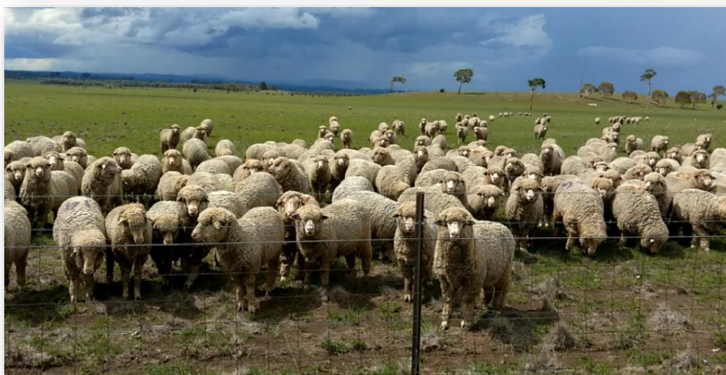
Figure 4. CSIRO research flock at the Chiswick research laboratory and farm are used for vaccine testing.

Sheep immunological studies have also been undertaken to investigate immunological response of sheep to control antigens simulating a flystrike vaccine. This is informing the effect of vaccine dose and longevity of the immunological response and assisting with formulation of the trial flystrike vaccines. In addition, studies in collaboration with Griffith University Glycomics Institute are underway to investigate the chemical synthesis and modification of vaccine antigens to modulate and improve the immune response of sheep to the vaccines.