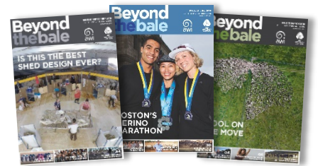
Beyond the Bale , AWI's quarterly magazine for wool levy payers, is posted direct to woolgrowers across NSW .

NSW woolgrowers can keep up to date via regular communications from AWI: