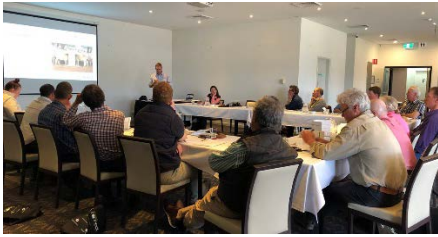
The Winning With Weaners workshop at Armidale in the New England region of NSW.