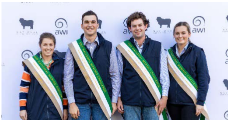
The winning Charles Sturt University team in the tertiary division at the 2019 National Merino Challenge.