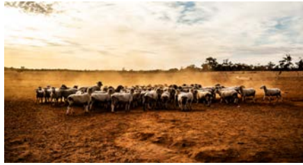
AWI provides a range of drought planning and management resources for NSW woolgrowers experiencing drought.