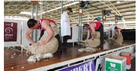
AWI-sponsored shearing and wool handling competition at Tamworth Show in north-east NSW.