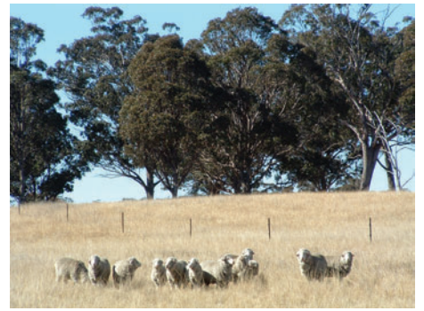
Below—Four-row tree lines provide dense habitat and stock shelter.