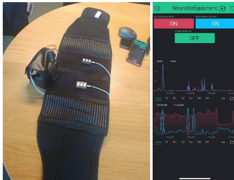
Figure 4. Wearable sensor prototype (left) with data collection mobile user interface (right).

It should be noted that a thorough product design and useability exercise will still need to be carried out. It should include a survey and a feedback-gathering process from the shearers and other stakeholders. The willingness of the shearer to invest in and wear such a device is important in the design (and the eventual adoption) of the product.