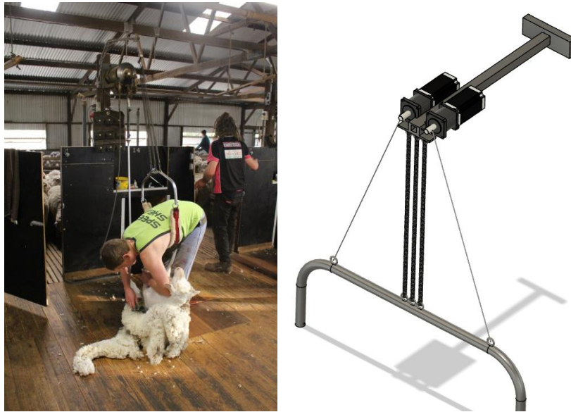
Figure 5. Shearer support back-harness (left). Concept of a modification to provide additional active support using a simple cable robot driven from above by electric motors (right).

To our knowledge the only approach to physical assistance that has gained any popularity is the shearer back-harness, which applies a small supportive force to the torso with a set of springs attached to a mount above the shearer while still allowing free movement (Figure 5).