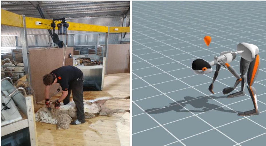
Figure 1. The portable data collection system that captured the motion and muscle activities of the shearer.