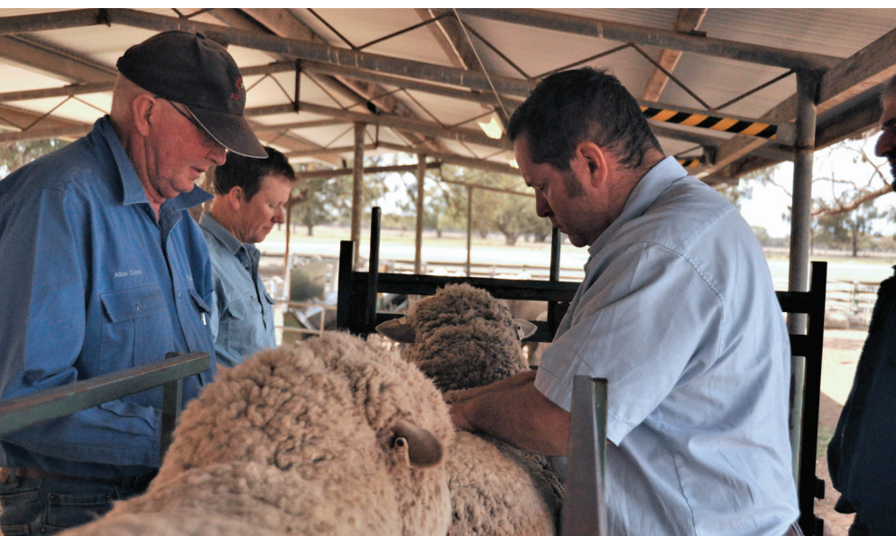
Sire evaluation classing, September 2018, NSW DPI Trangie.

This record number of joinings coincided with 14,795 downloads of Site Reports in 2017, indicating a strong level of interest in sire evaluation results. This builds upon important developments in sire evaluation, first among which was the recent AMSEA Historical Sire analysis.