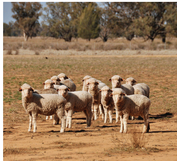
2018 drop sire evaluation MLP project F1 progeny, NSW DPI Trangie.

Evaluation of a sire's progeny is the key to sire evaluation. Progeny are managed together under the same conditions throughout the period of the trial, with the exception that single and twin bearing ewes can be separated prior to lambing and managed accordingly up until weaning. Ewe and wether progeny can also be managed separately. All progeny are evaluated with no culling, except for welfare purposes.