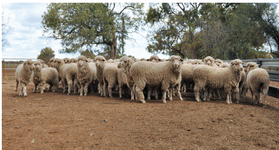
2017 drop sire evaluation MLP project F1 ewes, NSW DPI Trangie.

The ewes at each site are selected on the basis of offering an even, classed line that is representative of sheep typically run in that environment. An equal number of ewes are joined through AI to each sire. The minimum number of ewes joined to each sire is 50, with some sites choosing to join more.