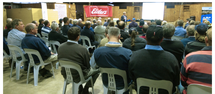
AWI supported a 'Future of the Fine Wool Merinos' panel discussion at the field day, which included industry experts from the NCWSBA, NSW DPI, Australian Merino Exports, Mecardo and AWI.