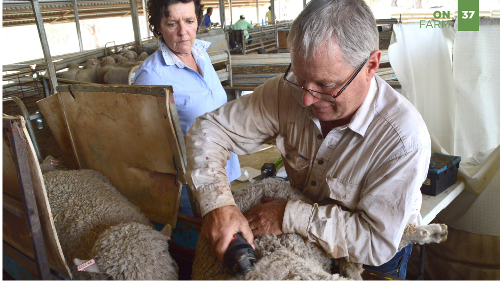
Mid-side sampling at the 'Elders Balmoral' sire evaluation site in March. The seven month old ewes on display at the site field day in April had been DNA sampled, body weighed, fleece tested, extensively classed and visually scored.

Discussions are still taking place to determine the future of the wether drop from the trial