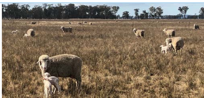
MerinoLink's MLP twinning ewes during lambing, May 2021.

A dry April was followed by rainfall of 14mm in May and 100mm in June resulting in good pasture availability just in time for lambing. Ewes were divided into lambing paddocks on May 3 with the 2016 drop ewes averaging 83.3kg and CS 3.2, and the 2017 drop ewes averaging 83.6kg and CS 3.4. Lambing proceeded smoothly and has finished recently with tagging of the F2 progeny scheduled for mid-July.