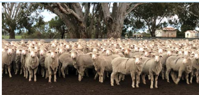
Balmoral's MLP ewes at pregnancy scanning, June 2021. Dark rib line is vegetable oil residue from EMD/FAT scanning.

A reasonable autumn break was followed up with good rainfalls in May and June. A total of 150mm has fallen in 2021 with 37mm falling in June. Pregnancy scanning took place on June 7, the 2015 drop achieved 96% conception and 156% foetuses, while the 2016 drop achieved 92% conception and 145% foetuses. The 2015 drop averaged 53.7kg, the 2016 drop averaged 51.9kg and both drops averaged CS 3.2. A worm monitor saw pressure remaining low. An updated report will soon be produced for the Balmoral site.