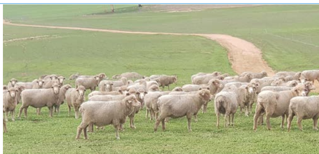
Pingelly's 2016 drop single bearing ewes, June 2021

Good pasture germination from summer / autumn rainfall has been followed up with 70mm received during May and 22mm during June. The MLP ewes are maintaining good condition and stopped receiving any feed supplements in late May. Pregnancy scanning took place on April 22, with 94% and 92% conception, and 154% and 141% foetuses in the 2016 and 2017 drops. The 2016 drop ewes averaged 63.9kg and CS 2.8 while the 2017 drop averaged 73.0kg and CS 2.9. An updated report for Pingelly is now available at merinosuperiorsires.com.au/mlp-project-reports