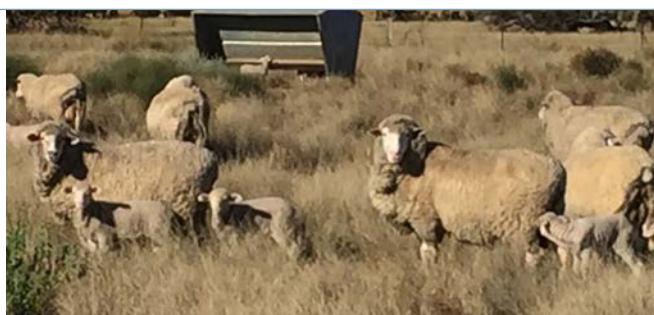
MLP F1 ewes and F2 lambs, June 2021.

Macquarie has had good rain events with 460mm received for the year and 68mm received in June. Ewes were drafted into lambing groups on April 28, the 2017 drop averaged 79.8kg and CS 3.6 while the 2018 drop averaged 79.8kg and CS 3.5. Over lambing ewes have been supplemented with feeders and roughage after paddock pasture cuts tested at 8MJ of metabolizable energy (ME). Tagging of the F2 progeny is scheduled for mid July.