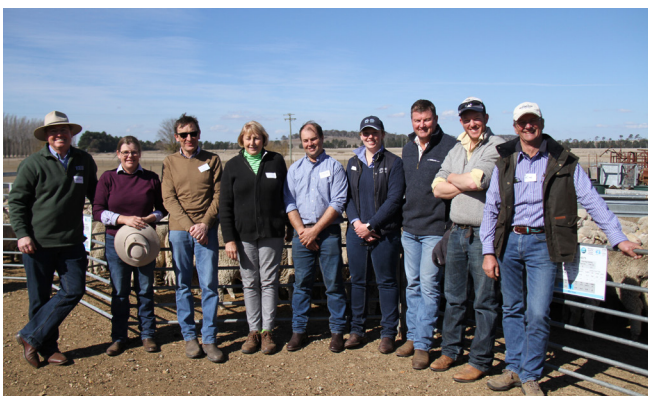
New England Site Committee back in 2018. Come along and see if it's not only the sheep that have changed over time

Keep an eye out for more details in future newsletters or via www.wool.com/MLP .