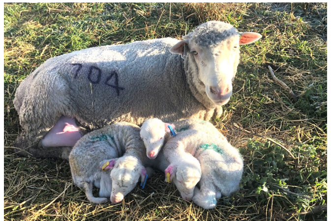
New England F1 Ewe raising triplets, September 2023

Mild weather was experienced through lambing and 2091 lambs were tagged at birth suggesting 170% lambs born to ewes joined. Lambs were marked in mid-October and will be weaned in December.