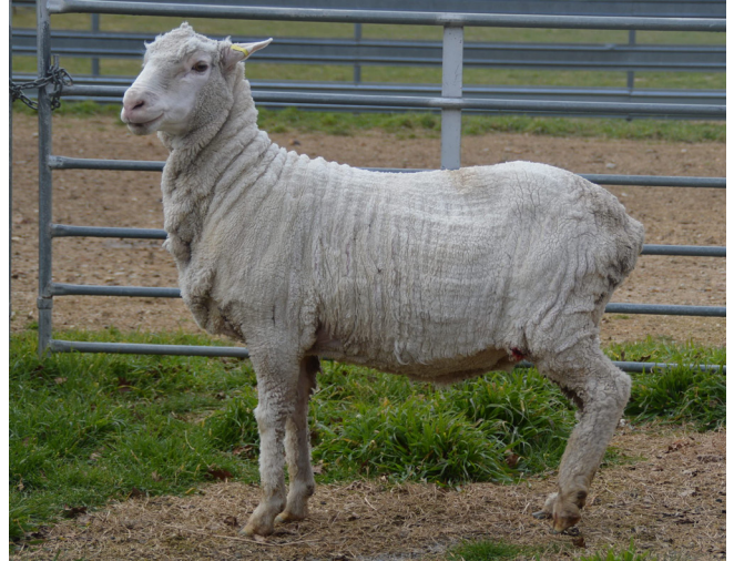
New England MLP Ewe, Body Wrinkle Score 4

Once the full MLP dataset is complete in July 2024, this analysis will be revisited to include additional traits such as the fleece traits and full lifetime records (out to six- and seven-year-olds).