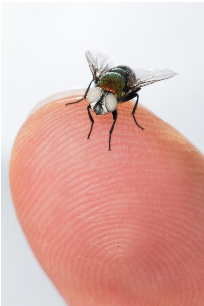
Figure 2. CRISPR/CAS 9 gene modification technology was used to knock out the eye colour gene of the sheep blowfly, producing a fly with white eyes.