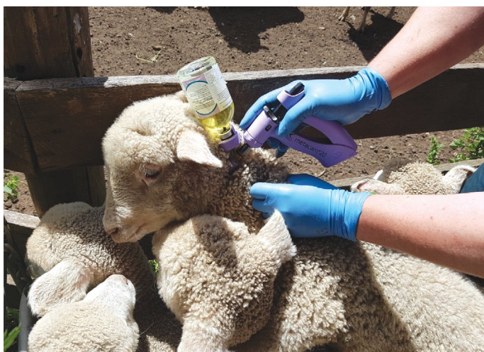
Products like Metacam® 20 administer meloxicam as a subcutaneous injection high on the neck behind the ear.

Products with meloxicam alleviate pain and reduce inflammation, fever and fluid production caused by tissue damage. These analgesic products are slower-acting than local anaesthetics but provide longer-lasting pain relief. When it comes to lamb marking these products can be used for mulesing, surgical castration, hot or cold knife tail docking, and castration and tail docking with rings.