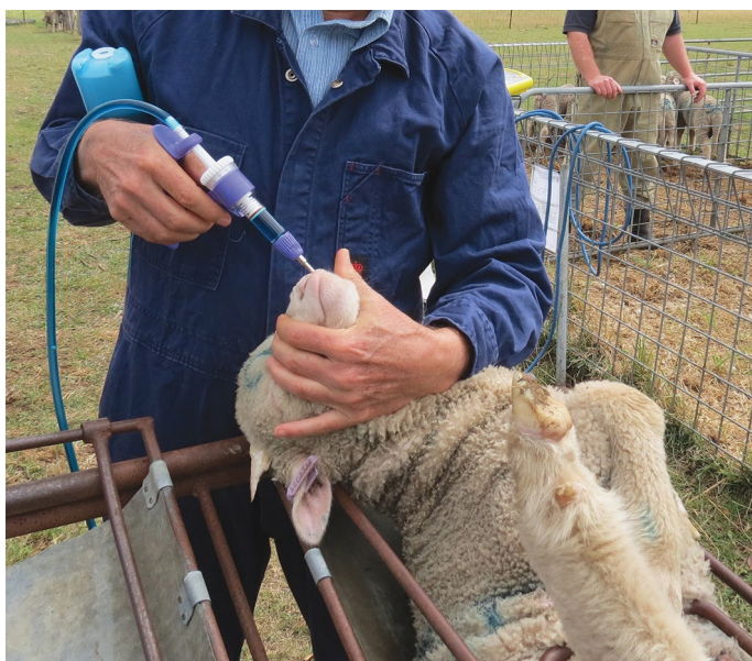
Products like Buccalgesic® administer the dose of meloxicam orally as a viscous paste, inside the mouth between the gums and cheek, with no needle required.

Meloxicam , a non-steroidal anti-inflammatory drug (NSAID), is registered for use as both an injectable product and for oral application.