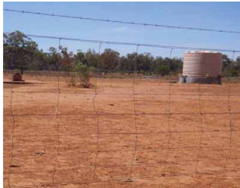
Figure 2: A water point enclosed with 8 line hinge joint pre-fabricated fencing with top and bottom barbed wire.