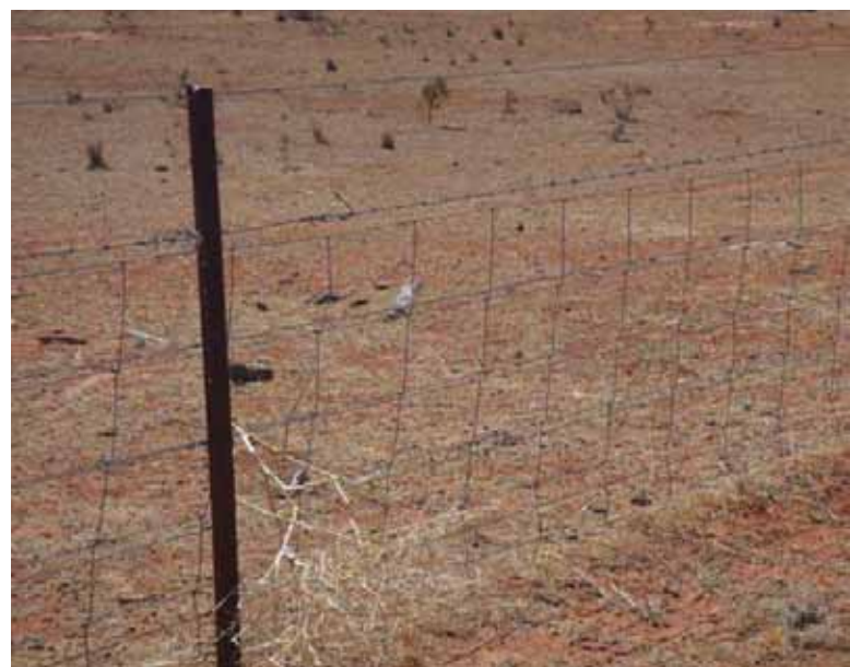
Figure 4: 6 line hinge joint pre-fabricated fencing over the existing 5 plain and 1 barbed wire fence.