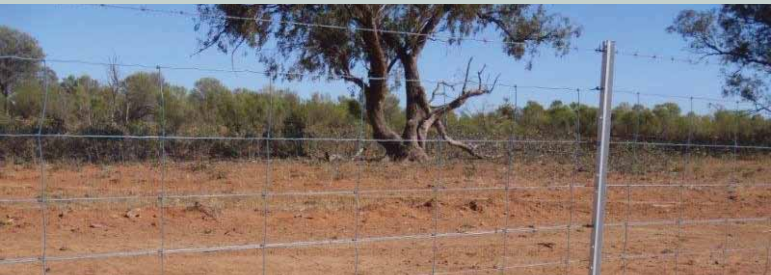
Figure 6: 8 line hinge joint pre-fabricated fence with top and bottom barbed wire.

To view more innovation profiles, business cases and videos of innovations in the pastoral zone, visit the Bestprac website www.bestprac.info