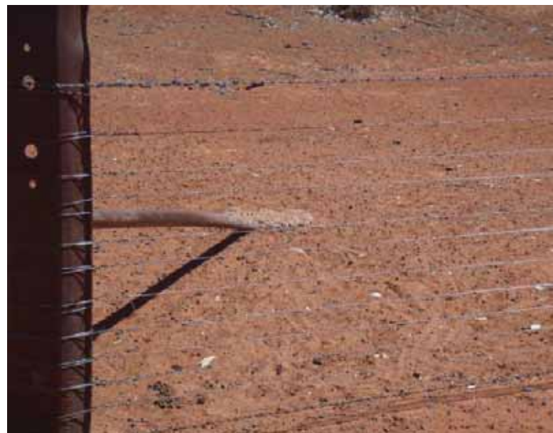
Figure 3: Plain wire run through every hole in the steel posts with top and bottom barbed wire.