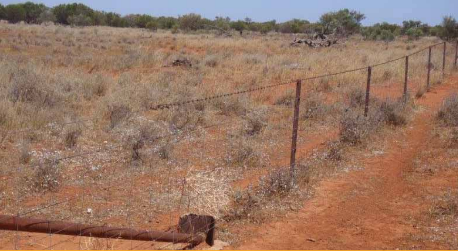
Figure 5: The existing fences were strengthened with 6 line hinge joint pre-fabricated fencing.