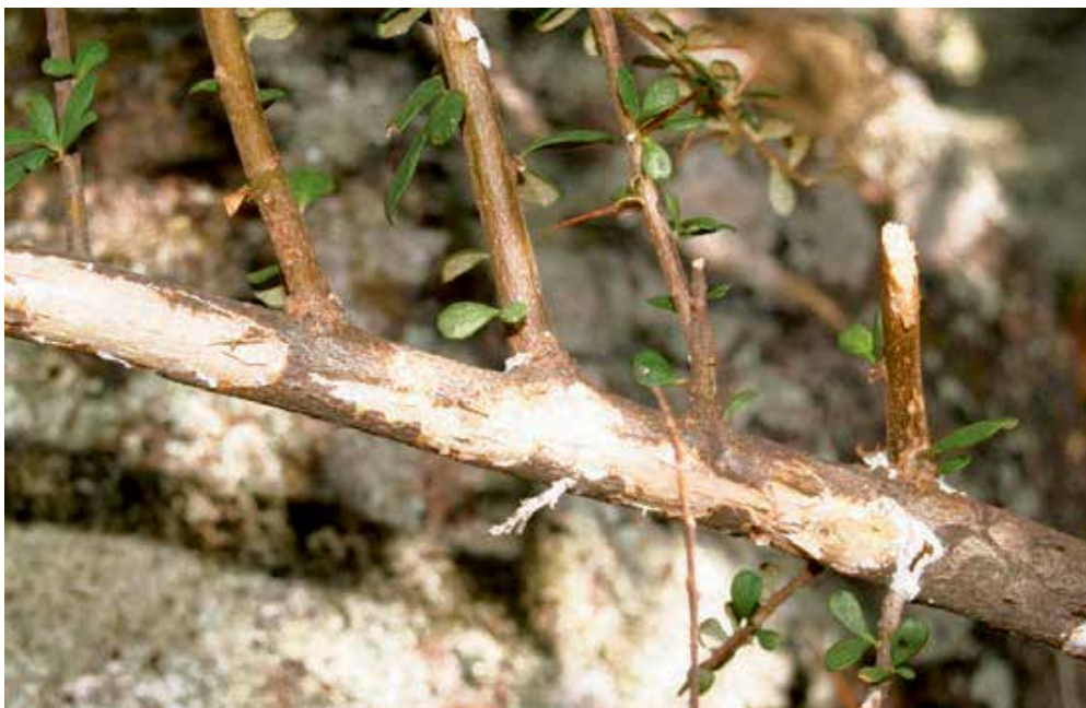
FIGURE 2: Rabbit damage showing stripping of bark and 45° ‘secateurs-like’ cuts through twigs.