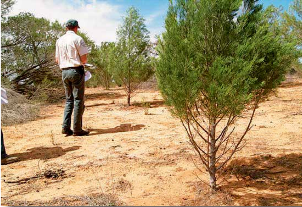
FIGURE 3: Absence of small seedlings and a distinct 'browse-line' 500 millimetres above the ground on older saplings indicates severe rabbit impact (Damage score = 5).

In some instances rabbits may have eaten all of the seedlings but the severity of grazing can still be ranked at '5' from the presence of a distinct 'browse-line' 500 millimetres above the ground on older saplings or mature shrubs with lower foliage within reach of the rabbits (see Figure 3 ).