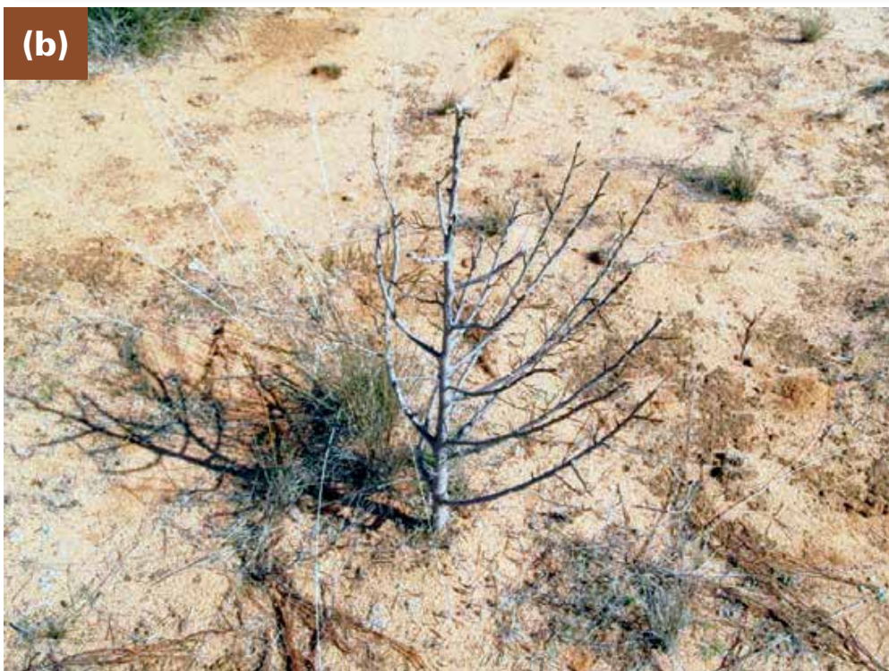
FIGURE 4: Native pines with: (a) little damage (score 1); or (b) complete defoliation (score 5).