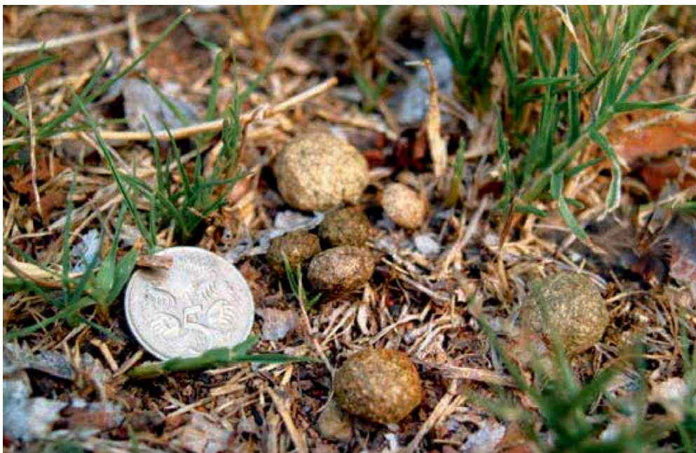
FIGURE 1: Typical small clump of rabbit pellets (faeces) in grassland.